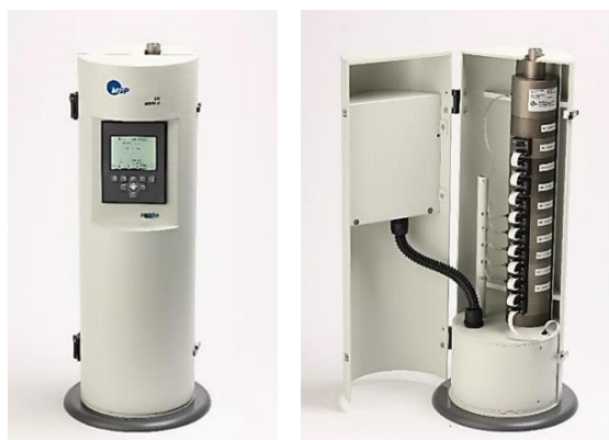
Figure 3: 120R NanoMOUDI impactor: exterior (left) and interior (right)

To combat against these negative effects, NanoMOUDI impactors are equipped with rotating stages. When the stage is rotated relative to the nozzle plate, the impacted particles are deposited in a more uniform manner across the impaction surface. This increases the amount of particle mass that can be collected without negatively affecting impactor performance.