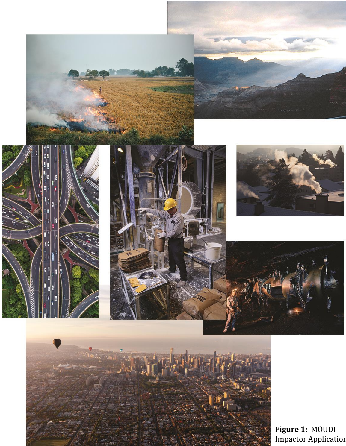
Figure 1: MOUDI Impactor Applications