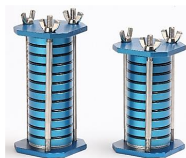
Figure 6: Spare Sets of Impaction Plates

This grease is used on O-rings that are located in the body of the impaction stages. One container of grease is included with purchase of any MOUDI™ impactor. Additional grease may be ordered using PN 0100-96-0558.