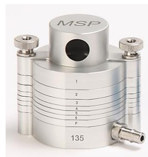
Figure 2: 135-6 MiniMOUDI Impactor

The MiniMOUDI™ impactors are ideal for personal sampling. They have a design flow rate of 2 L/min, which is supplied by a pump that can be worn by the user. The three models of MiniMOUDI™ have three different smallest cutpoints; users can go down to 0.56 µm, 0.18 µm, or 0.056 µm. Figure 2 shows the six-stage 135-6 MiniMOUDI impactor with the cowl inlet. This inlet is ideal for personal sampling; see the footnotes of Table 2 for more information on the available inlets for MiniMOUDI impactors.