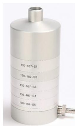
Figure 4: 130 High-Flow Cascade Impactor.

One unique feature of the high-flow impactors is that their nozzle plates are designed to facilitate a high degree of data quality for users who intend to conduct multiple offline analyses for each substrate. In such a case, it is commonplace to cut the substrate material into two or four equal pieces. To facilitate the equal division of substrates for this purpose, TSI® offers specially-designed nozzle plates with high-flow impactors. These nozzle plates distribute the nozzles symmetrically across the stage area in four quadrants, leaving a '+'-shaped area with no deposited aerosol.