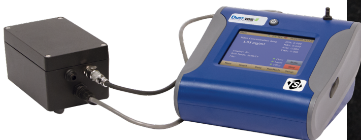
Desktop Monitor with External Pump, Model 8530EP

TrakPro™ Data Analysis Software allows you to set up and program directly from a PC. It even features the ability for remote programming and data acquisition from your PC via wireless communication options or over an Ethernet network. As always, you can print graphs, raw data tables, and statistical and comprehensive reports for recordkeeping purposes.