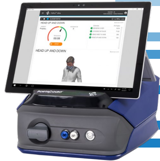
Tablet is sold separately or with the 8040T or 8048T packages.

Additionally, we have a single software solution for both fit test methods with Qualitative Fit Test Software. Offering step-by-step animated guidance on completing a qualitative respirator fit test consistently and correctly.