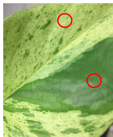
Figure 2. The Raman spectra of the lightest and darkest parts of the leaf are compared below (figure 3).