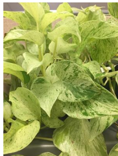
Figure 1. A variegated philodendron used for the Raman analyses.

The two chief regions analyzed with this technique are shown in Figure 2. The circles on this photograph indicate the fact that the spectra below compare the lightest parts of the leaf with the ones that are darkest green; this is not meant to represent the laser spot size, which is much smaller than the circles shown here.