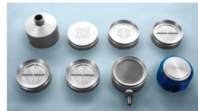
Figure 1. High-Flow impactor parts

Multiple nozzles at each stage provide flow conditions that result in sharp-cut size characteristics (Figure 3) and low pressure drop.