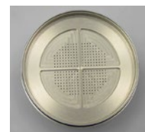
Figure 2. Nozzle pattern for Stage 3