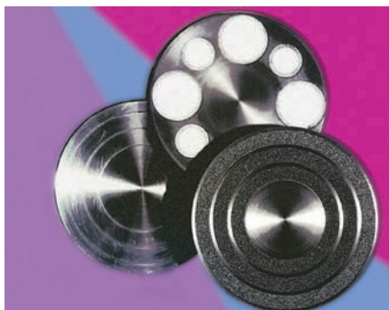
Supplied (lower right) and optional turntables.

TSI assumes no responsibility for personal injury or property damage due to inappropriate use of these instruments.