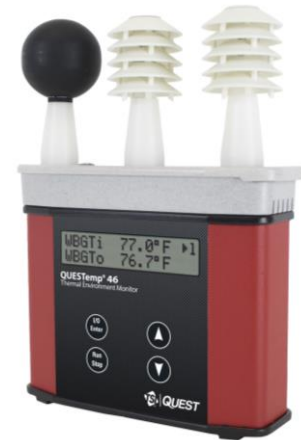
Figure 2: QUESTemp° 46

In Table 1 and Table 2, a Combined data set is listed in the Data Set column. In Table 1, the Combined data set consists of the data from the Laboratory, Outdoor, and No Air Flow data collections. In Table 2, the Combined data set consists of the data from the Laboratory and Outdoor conditions.