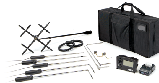
Model 8715 - shown with standard and optional accessories