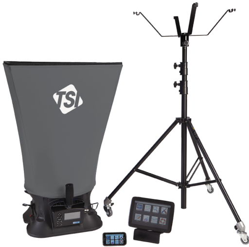
Model 8380 - shown with standard and optional accessories