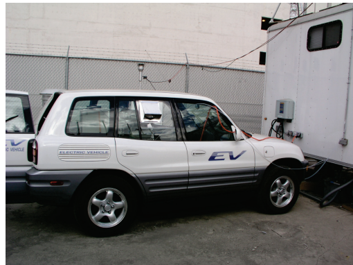
The mobile air-monitoring platform used by California researchers to monitor inside freeway traffic was installed in a Toyota RAV4 electric vehicle. This mobile laboratory provided exciting new data about aerosols in and around high-traffic areas.

TSI, TSI logo, DUSTTRAK, P-TRAK, and Scanning Mobility Particle Sizer are trademarks of TSI Incorporated. Toyota and RAV4 are trademarks of Toyota Motor Corporation.