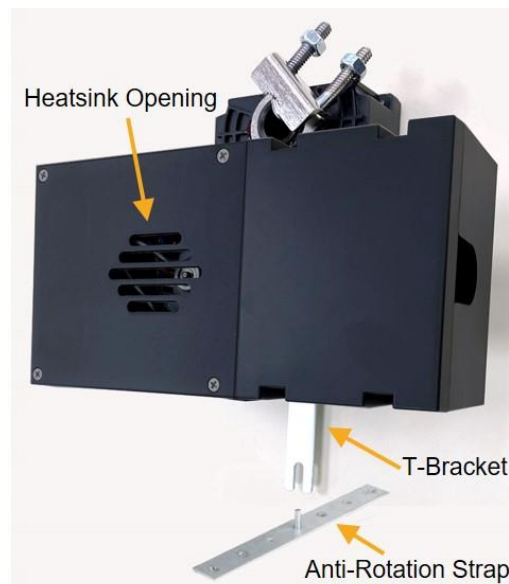
Figure 1: Electric Actuator

When power is initially applied, the actuator will momentarily fully rotate in the clockwise direction.