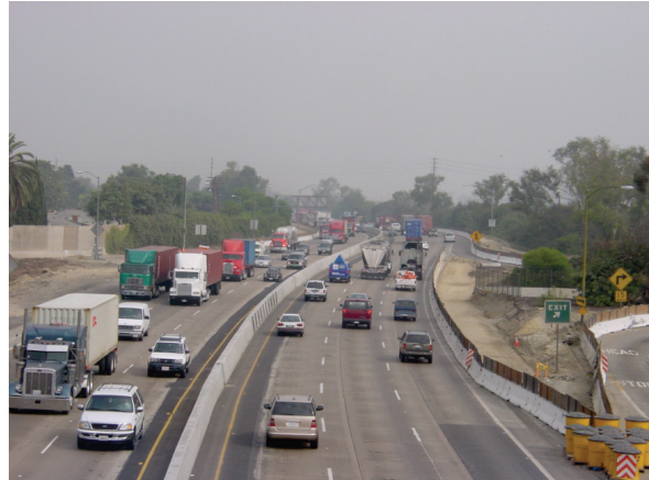
Measuring aerosol inside the traffic flow creates new challenges and insights.

Ultrafine particles, their components, and co-pollutants are thought to be especially harmful to people and may account for health impacts ranging from discomfort to death of people already compromised by illness. To date, very little is known regarding the physical or chemical nature of these particles or the nature of their