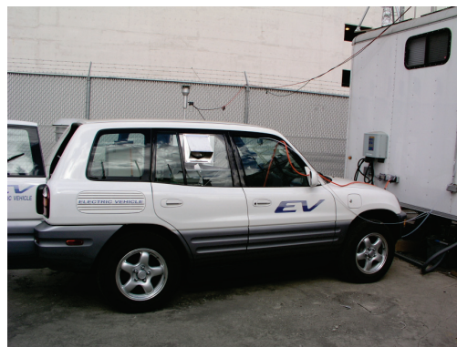
The mobile air-monitoring platform used by California researchers to monitor inside freeway traffic was installed in a Toyota RAV4 electric vehicle. This mobile laboratory provided exciting new data about aerosols in and around high-traffic areas.

The Los Angeles study found a surprisingly dynamic range of pollutant levels, with very great differences between on-road concentrations and those in communities no more than ¼ mile from the freeway edge. Several of the particulate phase pollutants track closely together, because they originate from the same traffic sources. A unique and challenging facet of this work was to determine the size distribution of ultrafine PM in these microenvironments. The SMPS systems were operated in a synchronized 60-second scan mode in hopes that they might capture the complexity of sources and operation conditions encountered. The researchers reported that indeed they were able to assemble robust, continuous size distributions over the size range of 6 to 600 nm. They also reported that ultrafine counts in excess of 4 million particles per cc were encountered during their studies. Counts on freeways are more typically in the range of 100,000 to 500,000 particles/cm 3 . Exposure while driving in these highly polluted microenvironments may dominate daily levels for the driving population.