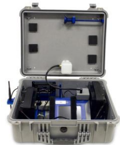
Environmental Enclosure Model 8535 with inlet assembly stored