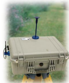
Environmental Enclosure in-use