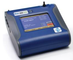
DUSTTRAK™ II or DRX Desktop Aerosol Monitor

Sub-isokinetic sampling takes place when ambient wind speed is greater than the sampling velocity found at the inlet point of the aerosol sampler. This creates a high-pressure area in front of the inlet and causes the flow streamlines to diverge around it. Extremely small particles (less than 1.0 micron) have low momentum and follow the streamlines. Larger particles that have more momentum will have a tendency to remain traveling in the same direction and enter the sampler rather than follow the streamline around it. This can cause the larger particles to be artificially sampled, resulting in a mass concentration reading that is higher than the true value.