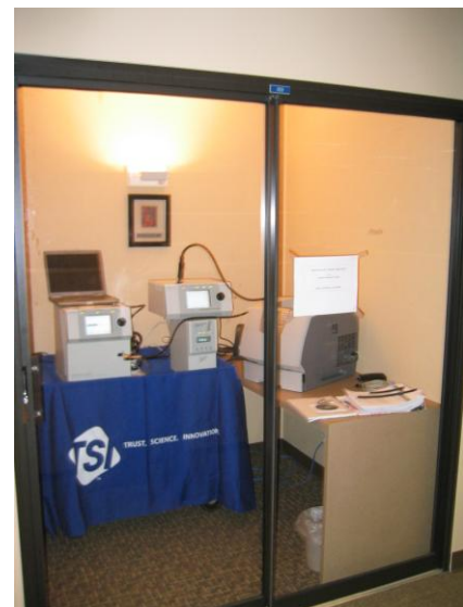
Figure 1: Phone booth office showing laser printer and measuring instruments

A small phone booth office at TSI Incorporated (Shoreview, MN) was used as a crude “chamber” (figure 1). The measurement instruments and the printer were placed inside the office with ventilation air