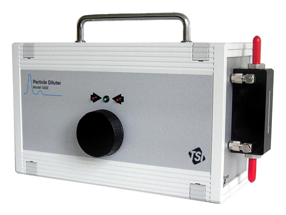
Model 3332 Dilution System

The indicator lights on the diluter indicate if the pressure drop across the capillary is what it should be (based on its calibration). If one of the red arrows is illuminated, an adjustment of the knob will restore the proper balance between the flows.