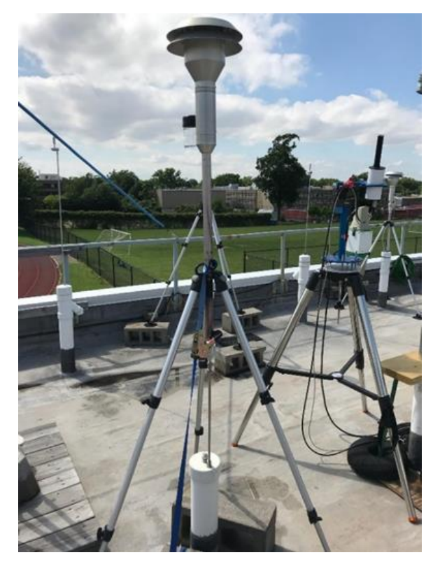
Figure 1: Sampling inlet for QCM-MOUDI™ impactor.

Generally speaking, shorter transport tubing is preferable, to reduce losses to the tubing walls.