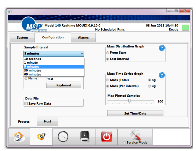
Figure 4: Screenshot of the configuration screen in the QCM-MOUDI™ impactor onboard software. Different sample intervals can be selected easily.

Sample interval options included in the QCM-MOUDI™ impactor are 10 seconds, 1 min, 5 min, 30 min, and 60 min, as shown in Figure 2 in the "Sample Interval" drop-down menu. While all of those options are available, some may not all be suitable for your particular conditions.