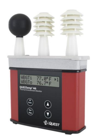
Figure 2: QUESTemp° 46

The first data collection was measured in the laboratory. For this set, the instruments were placed within an environmental chamber and the temperature was varied from 5^{\circ} C to 60^{\circ} C and humidity was varied from 19 percent to 97 percent relative humidity. With the first data collection, there was minimal radiant heat and the chamber circulation fan provided varying air movement over time.