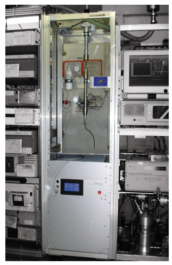
Figure 3. Model 3031 UFP Monitor with the Environmental Sampling System.