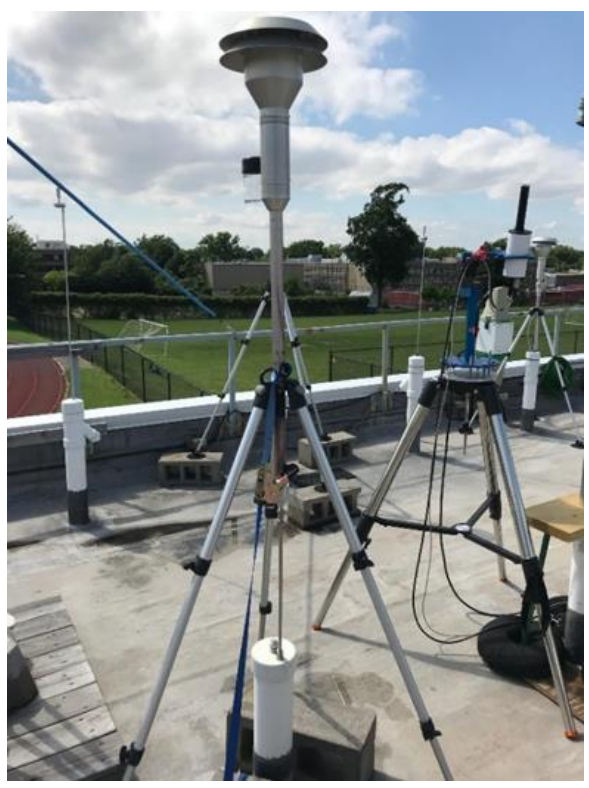
Figure 1: Sampling inlet for QCM-MOUDI™ impactor.

Conductive tubing will minimize the loss of particles due to electrostatics.