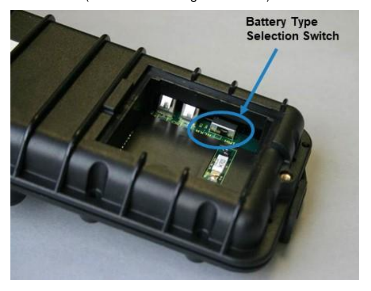
Figure 2-1 Location of Battery-Type Selection Switch