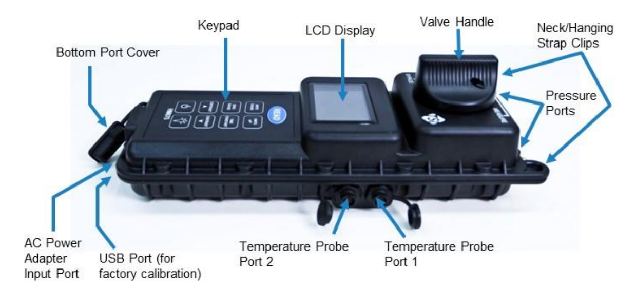
Figure 1-1 HM675 Meter Description

An accessory temperature probe is available as an optional tool for the HM675 Hydronic Manometer. The 1/8" diameter, stainless steel sheathed immersion probe is designed for measurement of water line temperatures.