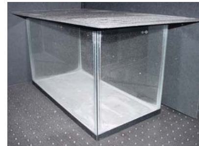
Figure 1: Tank with seeding particles.

Figure 1 shows the enclosure where the measurements were taken. Seed particles can be seen suspended in the air and on the bottom of the enclosure.