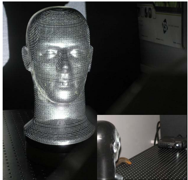
Figure 1: White light illuminated headform.

Figure 2 shows a single recovered 3-D image displayed from several points of view, with color indicating surface height. It is important to emphasize that all of these perspectives were generated from a single data set captured by the V3V camera.