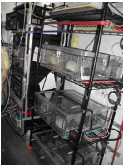
MEL Housing rats for inhalation study

One of the early activities conducted by the research team was to build a Mobile Emission Laboratory (MEL). The MEL is hauled by a full size Volvo tractor that is leased to the University at no cost. The sampling system in the MEL allows samples to be collected from a probes extending above the cab of the truck, from the front bumper, or from two sample probes located in rear corners of the MEL. This configuration allows samples to be taken either from the roadway or from the diluted exhaust plume of the tractor.