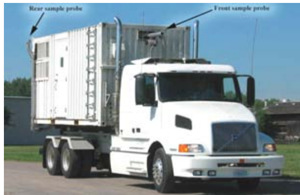
University of Minnesota Mobile Emission Laboratory (MEL)