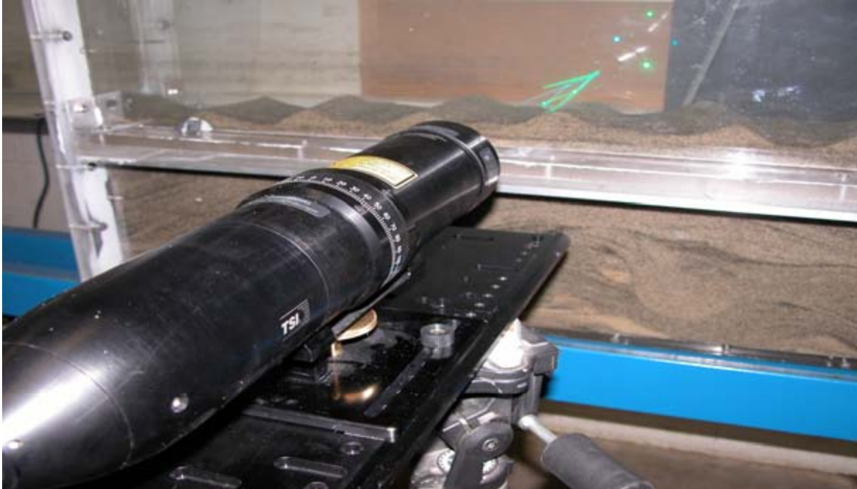
Figure 1: TR260 transceiver probe being used to measure phase-resolved velocities in a water channel flow. (water channel courtesy of the Ven Te Chow Hydrosystems Laboratory at the University of Illinois – Urbana Champaign)

Velocity measurement by Laser Doppler Velocimetry (LDV) typically involves seeding the flow with tracer particles and measuring their velocity, with the assumption that the tracers will faithfully follow the fluid motion. In certain cases, however, the flow is seeded with tracers as usual, but it also contains objects that we would like to know the velocity of. The challenge then is to distinguish the source of Doppler signals: Did it originate from a tracer particle or an object in the flow? In the past, various techniques have been attempted to make this distinction, such as fluorescence tagging, photomultiplier tube current measurement, and velocity binning. All these methods suffer from various shortcomings and are not reliable. Fluorescence tagging results in weak signals with poor SNR, photomultiplier tube current measurement is inconclusive since a small slow moving tracer particle will have similar tube current as a large higher speed object in the flow. Velocity binning is also inconclusive since some tracer particles having low or negative velocities would be indistinguishable from objects in the flow. Intensity measurement* and tagging is clearly the