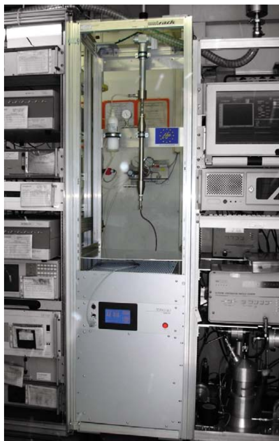
Figure 3. Model 3031 UFP Monitor with the Environmental Sampling System.

TSI Incorporated - 500 Cardigan Road, Shoreview, MN 55126-3996 USA USA Tel: +1 800 874 2811 E-mail: fluid@tsi.com Website: www.tsi.com UK Tel: +44 149 4 459200 E-mail: tsiuk@tsi.com Website: www.tsiinc.co.uk France Tel: +33 491 95 21 90 E-mail: tsifrance@tsi.com Website: www.tsiinc.fr Germany Tel: +49 241 523030 E-mail: tsigmbh@tsi.com Website: www.tsiinc.de Sweden Tel: +46 8 595 13230 E-mail: tsiab@tsi.com Website: www.tsi.se India Tel: +91 80 41132470 E-mail: tsi-india@tsi.com China Tel: +86 10 8260 1595 E-mail: tsibeijing@tsi.com