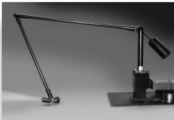
LASERPULSE Light Arm with laser (not included).

Specifications subject to change without notice.