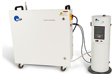
Figure 4: MOUDI-II Particle Sampling System 120R-120FC (left)