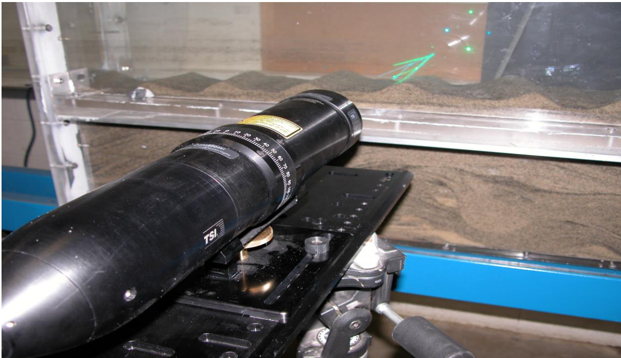
Figure 1: TR260 transceiver probe being used to measure phase-resolved velocities in a water channel flow. (water channel courtesy of the Ven Te Chow Hydrosystems Laboratory at the University of Illinois – Urbana Champaign)