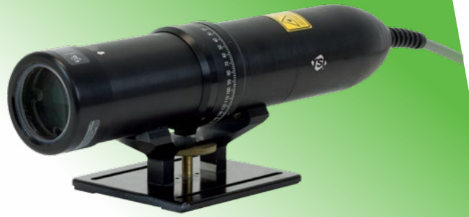
TRx60 Transceiver Probe

The transmitter probes are particularly designed for Phase Doppler, to get droplet size measurements in sprays. The large fringe spacing and measuring volume are ideal for small droplet size range. The transmitter probe can also be equipped with a beam expander or contractor (XPD50-E or XPDN50-I), to expand the droplet size range.