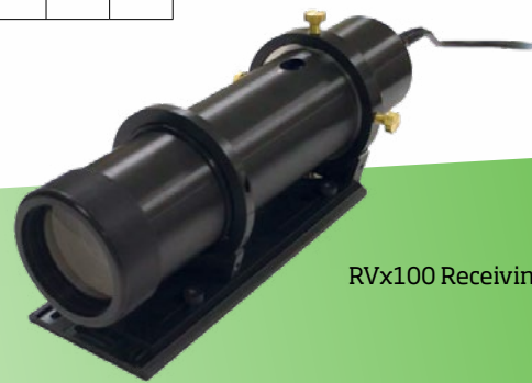
RVx100 Receiving Probe