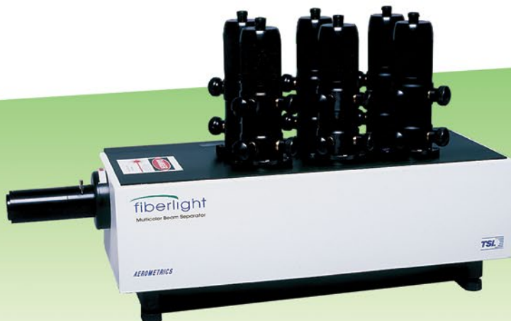
Fiberlight color separator module to be used with Ar-ion laser, DPSS, or fiber laser.