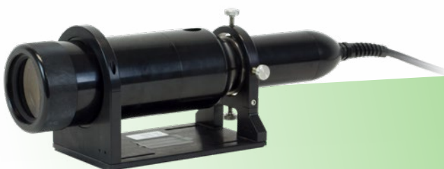
RVx070 Receiving Probe