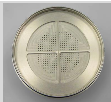
Figure 2. Nozzle pattern for Stage 3

Multiple nozzles at each stage provide flow conditions that result in sharp-cut size characteristics (Figure 3) and low pressure drop.