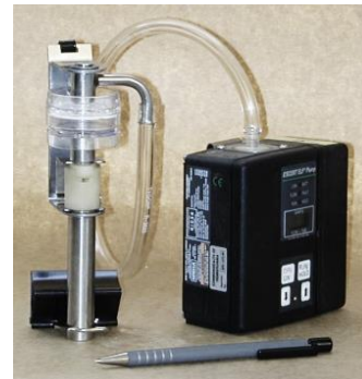
Sample Pump with Respirable Silica Sampling Train