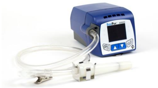
TSI AM520/AM520i Personal Aerosol Monitor and Dorr-Oliver Cyclone