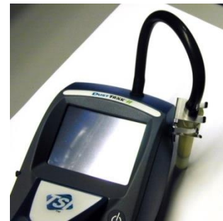
TSI Handheld DustTrak II with Dorr-Oliver Respirable Cyclone