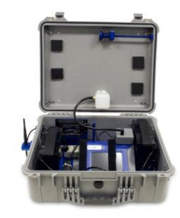
Environmental Enclosure Model 8535 with inlet assembly stored