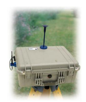
Environmental Enclosure in-use