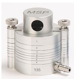
Figure 3: 135-6 MiniMOUDI Impactor