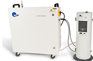
Figure 4: MOUDI-II Particle Sampling System 120R-120FC (left)