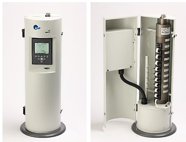
Figure 1: 120R MOUDI II Impactor: exterior (left) and interior (right)

Several factors can affect the selection of the smallest cutpoint. For example, the particle size of the smallest cutpoint can have a significant impact on the type and size of the pump needed to operate the impactor. If the researcher has practical or budgetary restrictions, that may affect the pump (including weight and the use of oil in a vacuum pump), the smallest cutpoint should be chosen with these restrictions in mind.