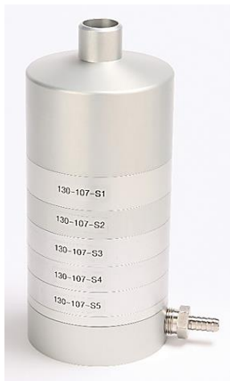
Figure 2: 130 High-Flow Cascade Impactor

In some cases, the questions of particle size and sampling flow rate must be considered simultaneously. For example, if the researcher intends to perform gravimetric measurements on the collected samples, collecting enough mass at the smallest particle size for the sample to be measurable may require very long sampling times. As such, the researcher’s experimental design should be taken into consideration as well when choosing the smallest cutpoint.