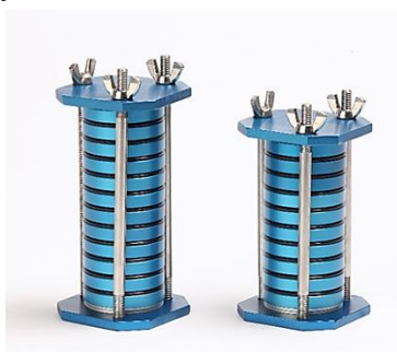
Figure 5: Impaction Plates & Filter Holder.