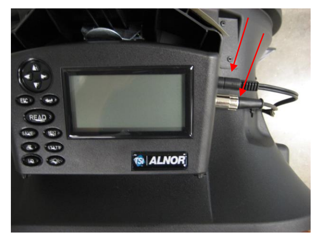
2. Pinch strain relief bushing and push through the base hole.

1. Locate and unplug custom cable and thermister probe cord from meter display.