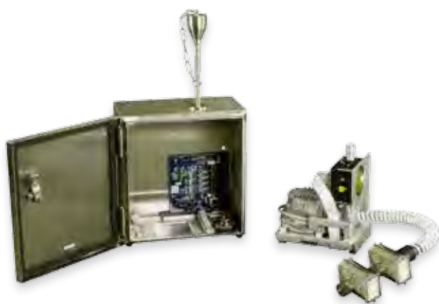
Hot Swap Optical Sensor and Pump